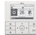
Wired Remote Controller (High grade)