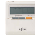
Wired Remote Controller